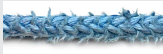
Abrasion occurs both externally, along the surface of the rope and internally, inside the structure of the rope. It is important to evaluate both forms to accurately assess the condition of the rope.

The comparator is an easy reference that can be used in the field to help assess the state of a rope. Small and easily held in the hand while performing an inspection, it helps establish a guideline and a common language when discussing the state of a rope. It is printed on extremely durable synthetic paper that is resistant to tearing and comes packaged in a vinyl sleeve to make it 'pocket friendly.'