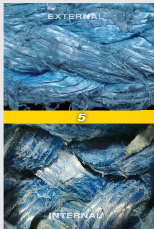
SHOWN AT ACTUAL SIZE: The detailed photos make comparison quick and accurate.